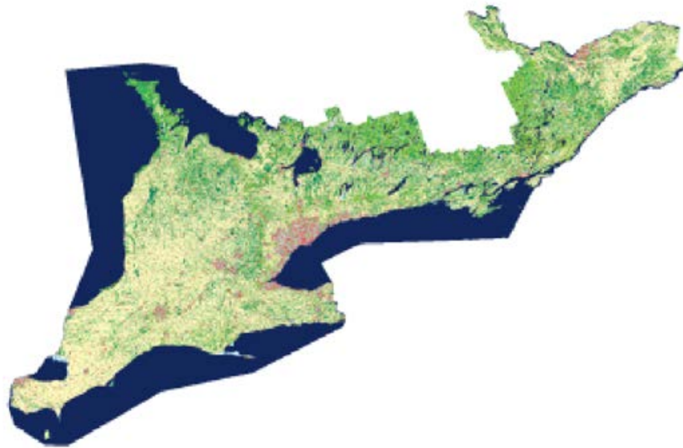
Figure 1. Map showing SOLRIS extent (MNR 2019)

The remainder of the province was not analysed for this update as neither the Far North Land Cover 1.4 (FNL 2014; OMNRF 2014) nor the Provincial Land Cover 2000 (PLC2000; Spectranalysis Inc. 2004) have been updated since the last SOBR indicator report in 2015. Data from PLC2000 were used to assess land cover in the year 2000. The 2011 information for this large part of the province was assessed using two sources; the Far North Land Cover 1.4 which includes the entire Hudson Bay Lowlands Ecozone and the northern portion of the Ontario Shield Ecozone and an update to the rest of the PLC2000 that was incorporated spatial information maintained by the OMNRF on forest harvest, forest regeneration and burns. Among the various land cover products, the information for southern Ontario (SOLRIS) has the highest resolution and was developed using a more accurate classification method than the PLC2000, so distinguishing between real and methodological changes in this area is more problematic (OMNRF 2014); the PLC2000 land cover classes consist of vegetation types (such as forest, wetlands and agricultural crops or pasture) and categories of non-vegetated surface (such as water bodies, bedrock outcrops or settlements). These classes reflect the nature of the land surface rather than actual or potential land use (Ontario 2002).